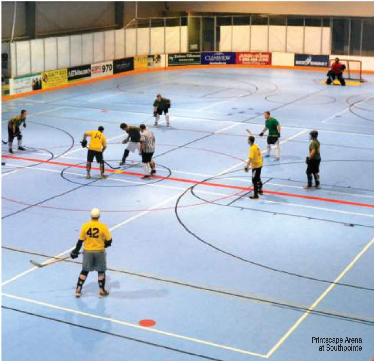
Printscape Arena at Southpointe