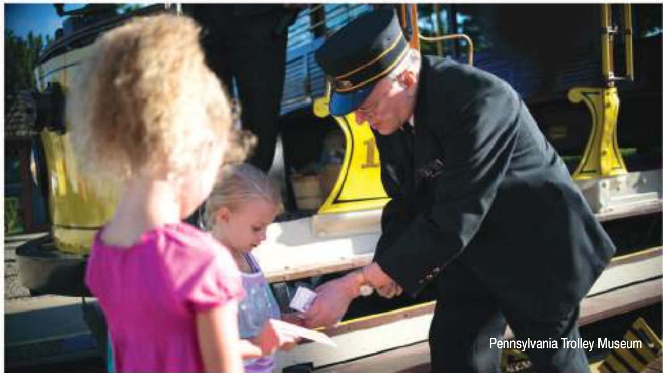
Pennsylvania Trolley Museum