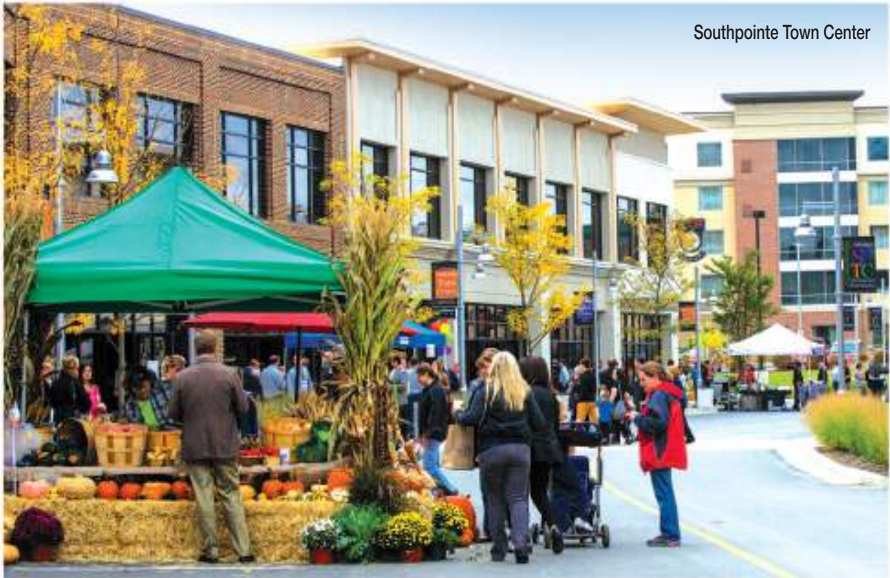
Southpointe Town Center