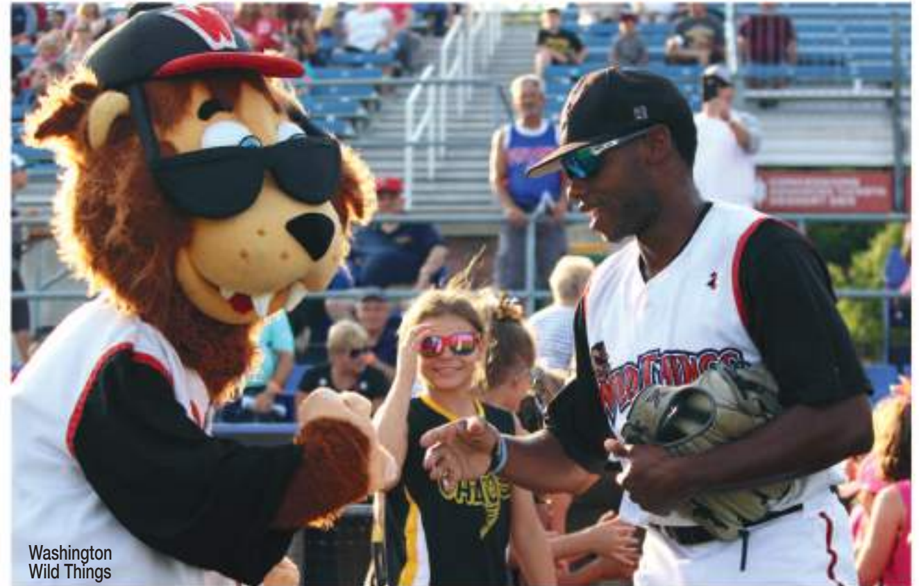
Washington Wild Things

Charming park featuring picnic shelters, playgrounds and a boat launch.