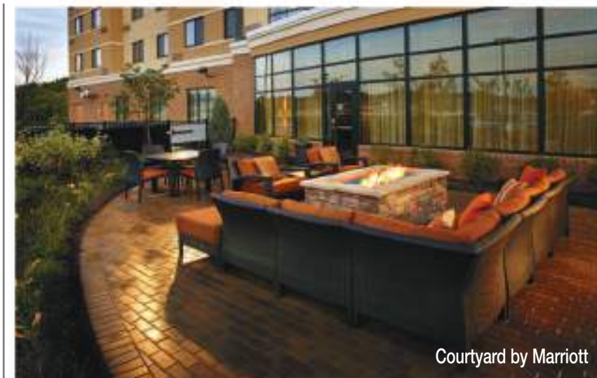
Courtyard by Marriott

Homewood Suites by Hilton Pittsburgh/Southpointe 3000 Horizon Vue Drive Canonsburg, PA 15317 724-745-4663 pittsburghsouthpointe. homewoodsuites.com