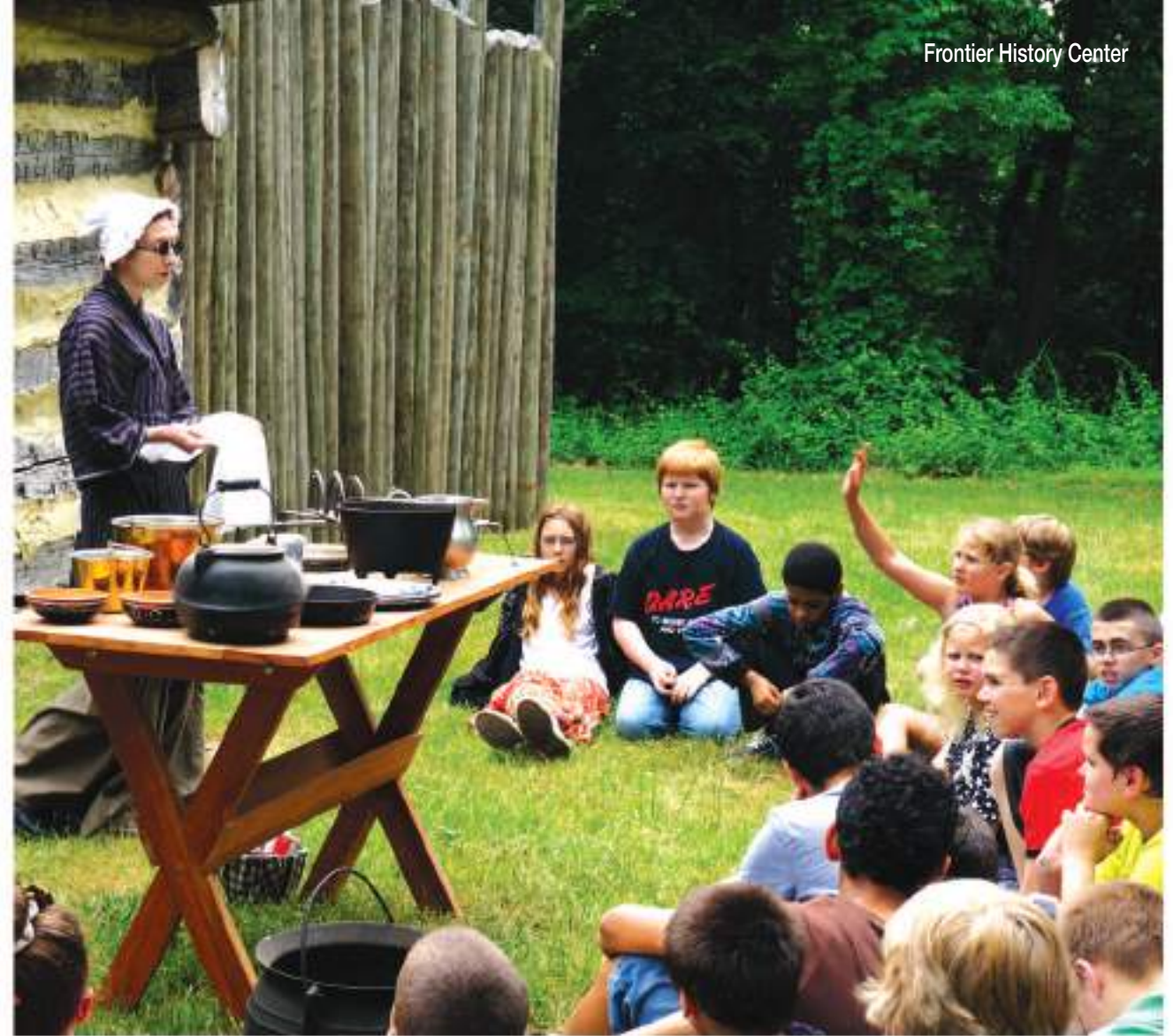
Frontier History Center

History 16,000 years in the making! Explore the prehistoric Meadowcroft Rockshelter, 16th Century Indian village life, the 18th Century frontier and 19th Century rural life.