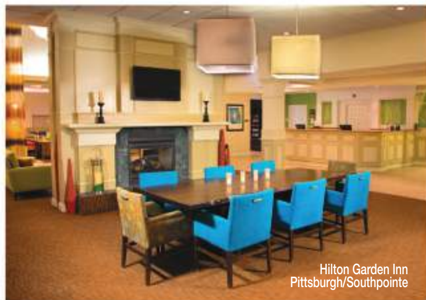
Hilton Garden Inn Pittsburgh/Southpointe

Whispering Pines Family Campground 1969 Henderson Avenue Washington, PA 15301 724-222-9830