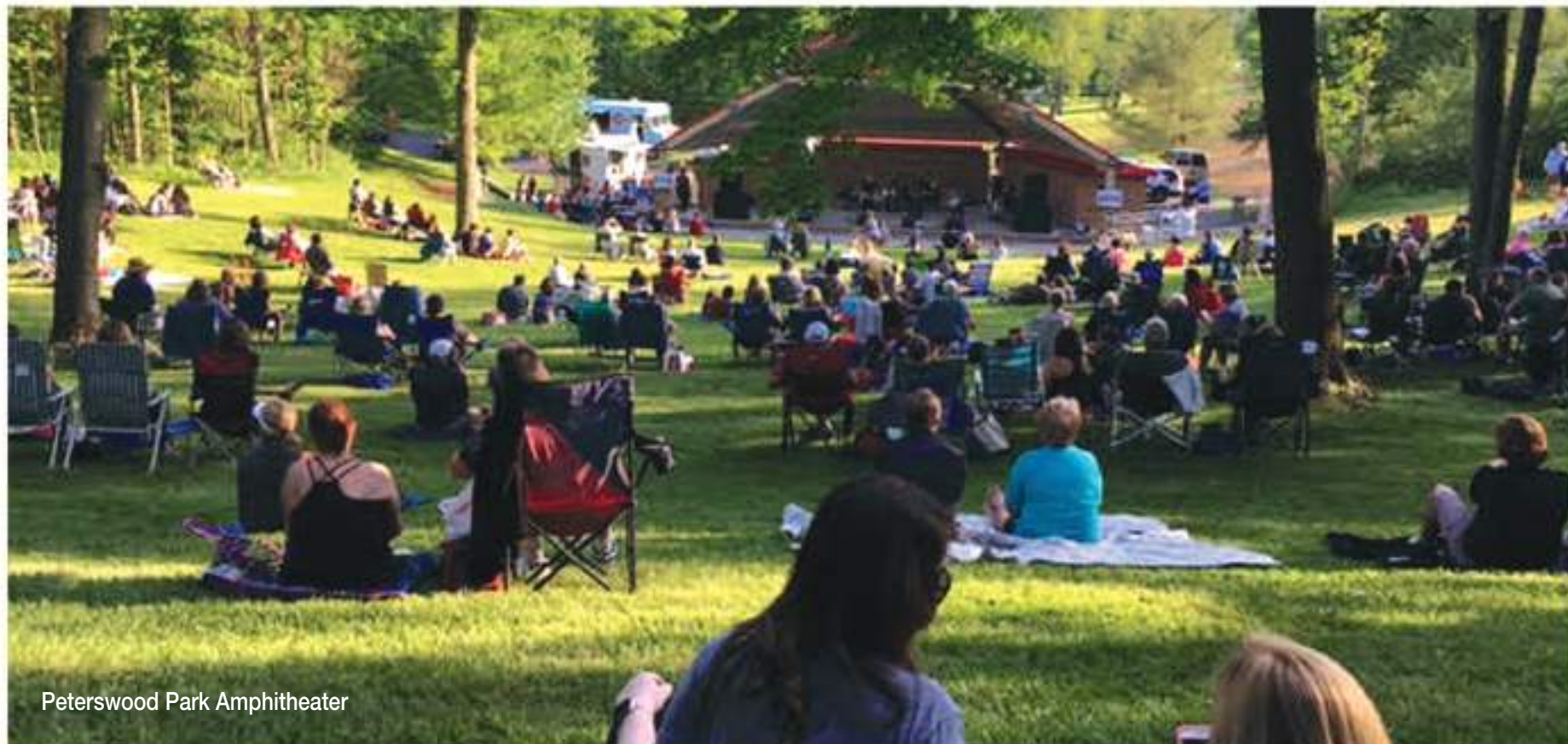
Peterswood Park Amphitheater

Concerts are held for music lovers of all ages to be educated and inspired by excellent musical performances throughout the year.