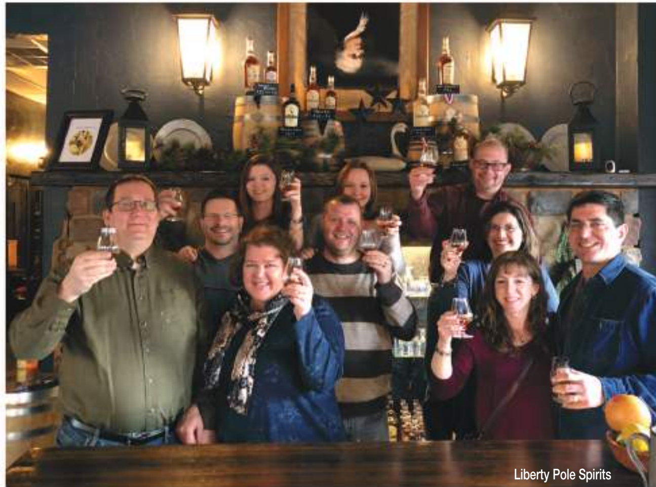
Liberty Pole Spirits