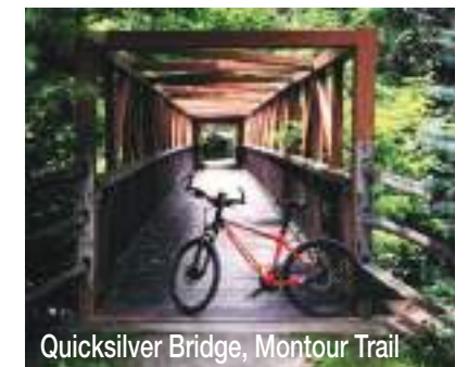
Quicksilver Bridge, Montour Trail

Indoor trampoline park featuring freestyle bouncing, dodgeball, fitness programs and more.