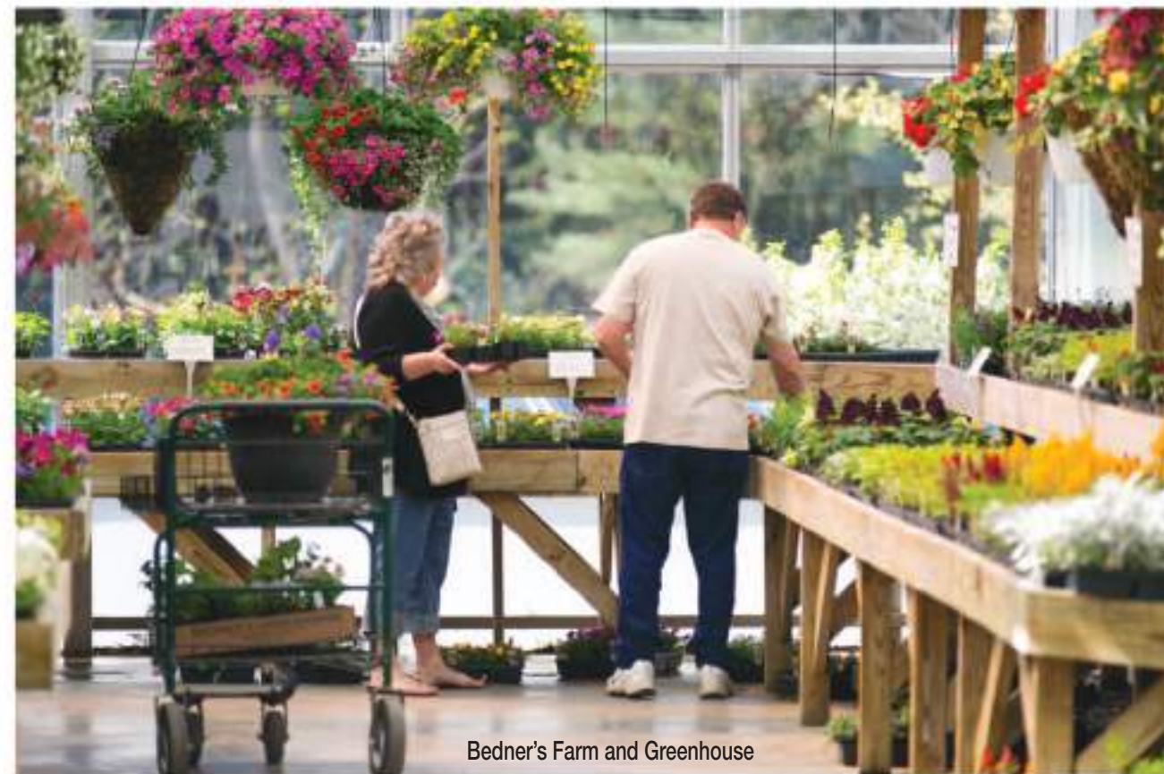
Bedner's Farm and Greenhouse