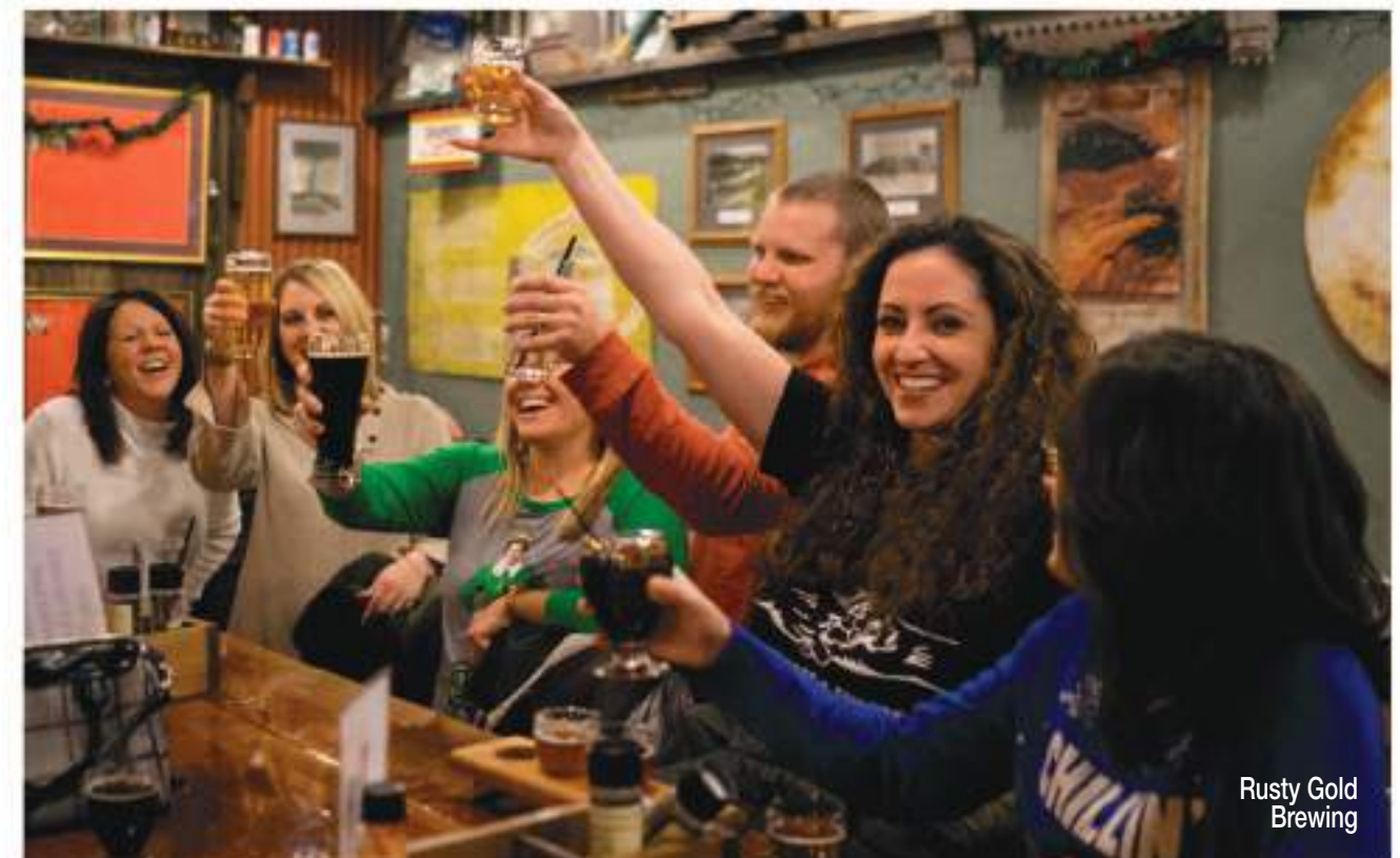
Rusty Gold Brewing

Family-owned and operated, Whitehorse Brewing continues to bottle and cap their own all-natural beers which will be offered at this new tap room on Racetrack Road.